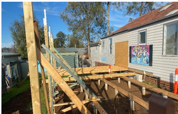
July 2023, deck building begins!