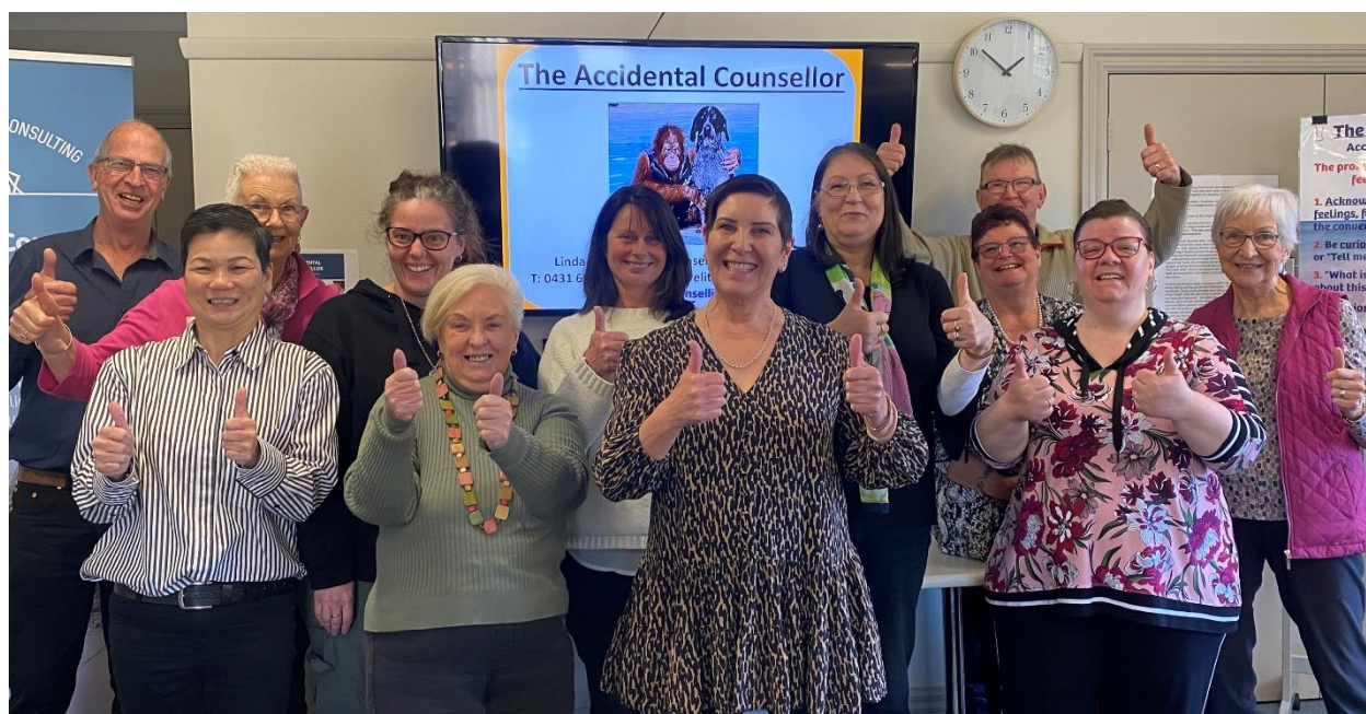
Volunteers and staff participated in Accidental Counsellor training, August 2023.