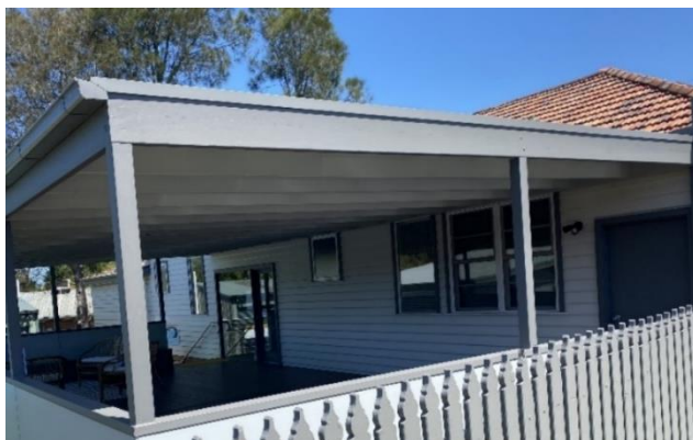
October 2023, the deck is complete!