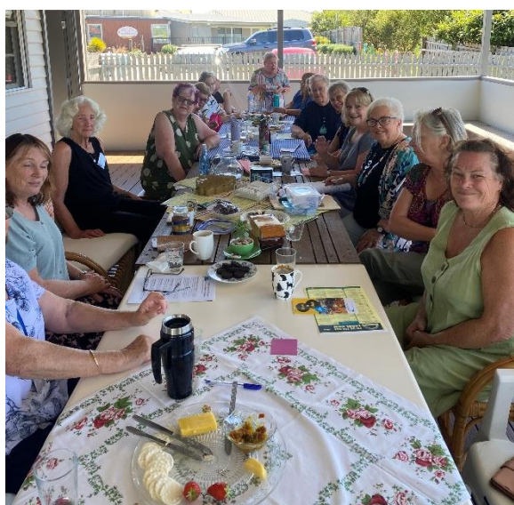
Warragul Golden Girls enjoy using the new deck.

As several existing members moved on to other events in their lives such as moving out of the area or taking up other activities, new members have come in and are always greeted with a friendly face, good conversation and, most importantly, lots of laughter. 2023 brought about many such changes and it was with sadness that we saw some of the original faces leave us, but we still keep in contact as that is what good friendships are all about. We had some wonderful morning teas and lunches, the highlight being one on our new deck, the pride and joy of each of us at the House. The stories of why women join our group and varied, and all are important. Many seem to be from moving to the area and not knowing anyone. As we get older it is often difficult to make new friends and this is what makes our groups so vital. We hope to continue for many years to come.