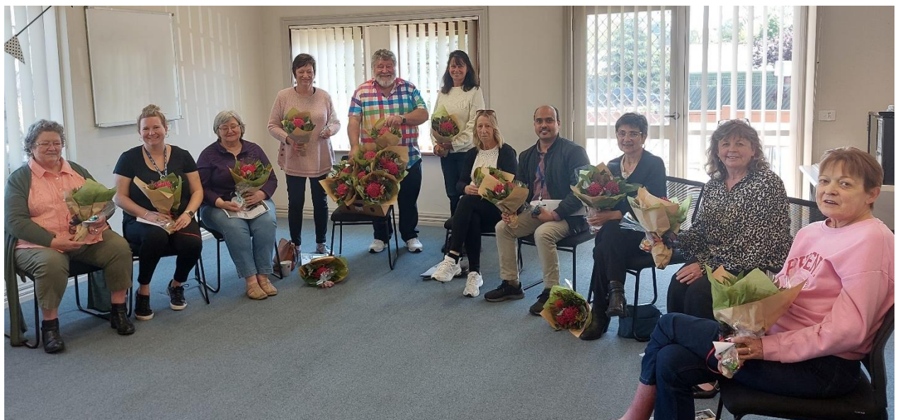
Above: Front desk volunteers and staff participated in training on understanding ourselves as individuals.

Our wonderful Social Group facilitators are slowly increasing, providing exceptional support to our social groups. These volunteers include: Pat Kennedy (knitting group), Di Crowther (bridge group), Pat Sturge (creative writing group), Barb, Cheryl, & Glenis (Golden Girls), Joe Defazio (Café in Italiano) and Barb Mewburn (Warragul fibre and diamond art group).