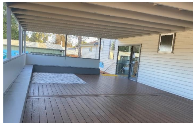
Nov 2023, the deck is ready for use!