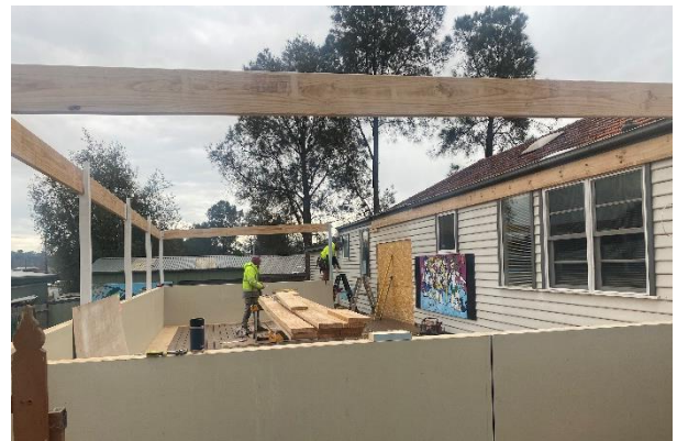
Aug 2023, the deck floor is complete